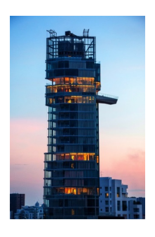
The elegant Sculptura in twilight