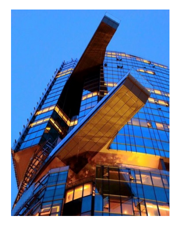
Photo captions: Introducing the next generation lifestyle, Sulptura Ardmore.